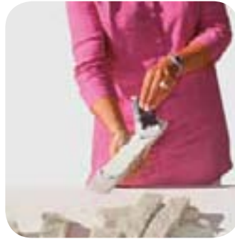
2. Apply glue*