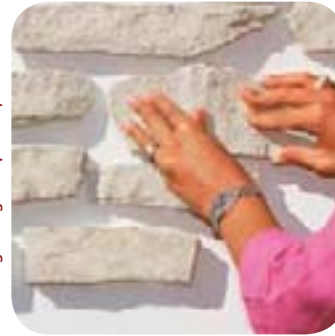
3. Place stones