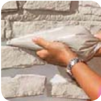
5. Fill joint