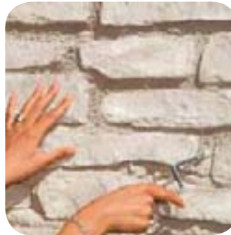
6. Smooth joint