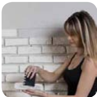
2. Apply glue