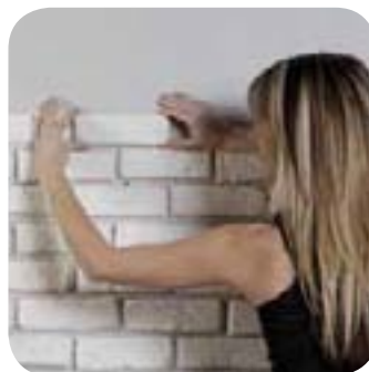
3. Place stones