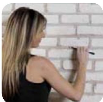
5. Smooth joint