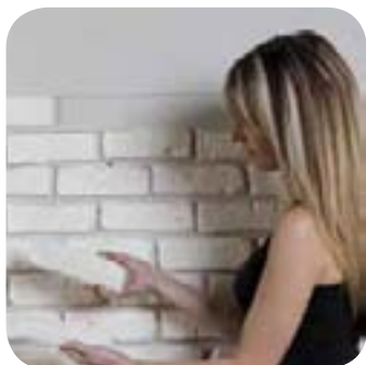
1. Choose stones