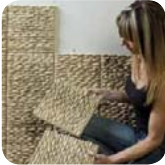
1. Choose stone