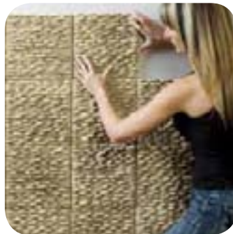
3. Apply stone