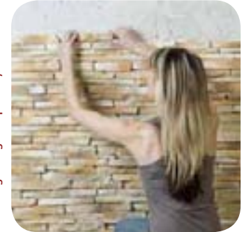
4. Place stones