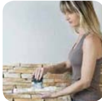
2. Apply glue on back