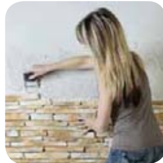
3. Apply glue on wall *