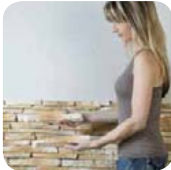
1. Choose stone