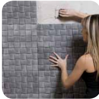
2. Apply glue on wall *