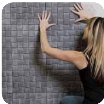
3. Place stones