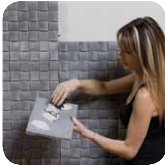
1. Apply glue on back