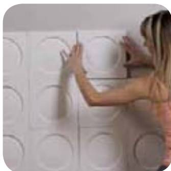
2. Place stones